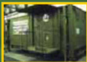
DEPLOYABLE CBRN ANALYTICAL LABORATORY (STANAG 4632)

CONFORM TO THE QUALITY SYSTEM STANDARD AQAP 2110 and ISO 9001:2008