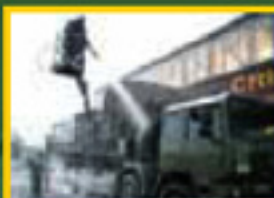
DDMAS LARGE SCALE DECONTAMINATION SYSTEM DUAL OPERATORS