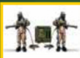
SANJET C 1126 HR CBRN DUAL OPERATOR DECONTAMINATION AND DETOXIFICATION GROUP