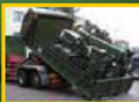
DDMAS LARGE SCALE DECONTAMINATION SYSTEM HIGHLY DEPLOYABLE