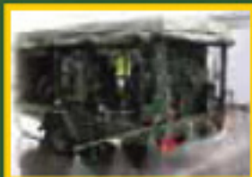
RVCBRN TRAILER FOR CBRN DECONTAMINATION AND DETOXIFICATION