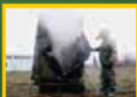
TSDM-TACTICAL STEAM DECON MODULE

ONLY ONE PERSON ONLY ONE MACHINE ONLY ONE PRODUCT