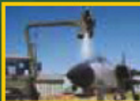
MOBILE SYSTEM FOR AIRCRAFT DECONTAMINATION