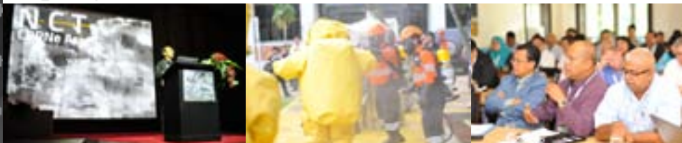
All pictures were taken at NCT CBRNe Asia 2012

IB Consultancy is proud to announce Asia's premier CBRNe event, The Non-Conventional Threat: CBRNe Asia 2013, which will take place on 24 to 27 September 2013, in Le Méridien Kuala Lumpur, Malaysia. Building on the highly successful 2012 conference, exhibition and CBRN demonstration, NCT: CBRNe Asia 2013 will expand its scope by including focused interactive training-workshops, live product demonstrations and the NCT CBRNe Awards. The conference will include high-level speakers from Asia, Europe, Middle East and the USA.